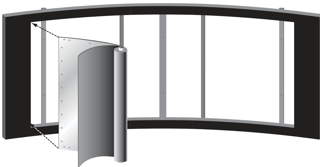
Figure 2: Unrolling the Screen for Attachment to the Frame